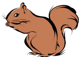
March Scampering Squirrels