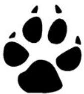
February Tricky Tracks

The theme for this 5 program series is In Our Own Backyard, and will be conducted between 10 and 11:30am on the 3rd Saturday of each month starting in February.