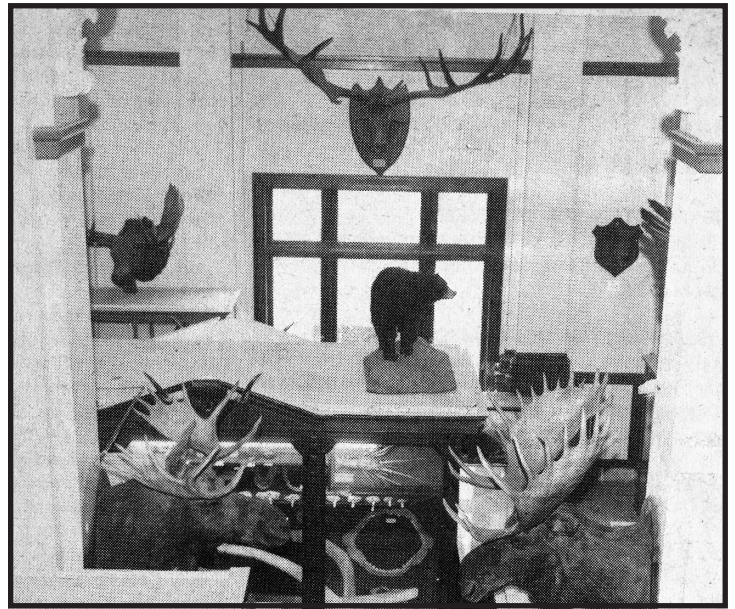
View from the second floor of the museum looking into the main hall. This photo appeared in the Free Press May 12, 1965.

antlers only) from an antique store in Texas in the 1890's. An elk hide seems to have been added in the 1920's by the Audubon Society for aesthetic reasons. From what I understand an attempt was made to return the specimen to its original purchased condition but the bone underneath the hide was too delicate to carry this out.