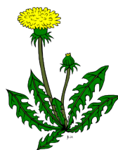
April Dandy Dandelions