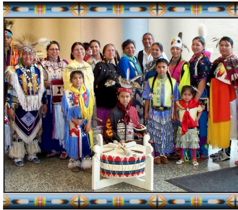
Dancers and Drumming of the Black Hawk Performance Company