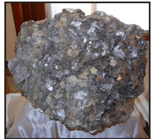
Known as 0022-0002-072 to our volunteers or 1 large heavy piece of Muscovite to our visitors.

We wish them well as they continue their college and high school education and hope when they get back and have some free time they'll want to spend it here helping us out.