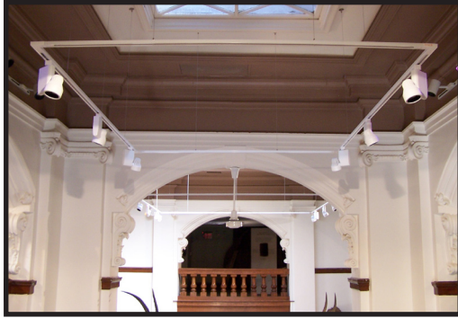
From the 2nd floor looking into the main hall.

Light can be devastating to organic materials as you might realize. We've all seen the affect of sunlight on fabrics in our house. Because we are illuminating very old and delicate objects, the lights being installed at the Museum cannot give off any infrared or ultra violet radiation. Ringing the skylights in both these wings are low wattage, eco-friendly, LED fixtures. Each light requires only 27 watts of electricity. The older canisters that they are replacing required at least 75 watts, and there were twice as many. That's not