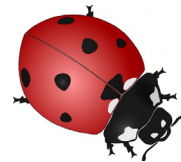
May Lucky Ladybugs