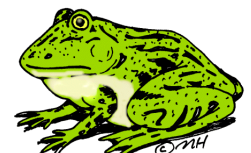
June Funky Frogs